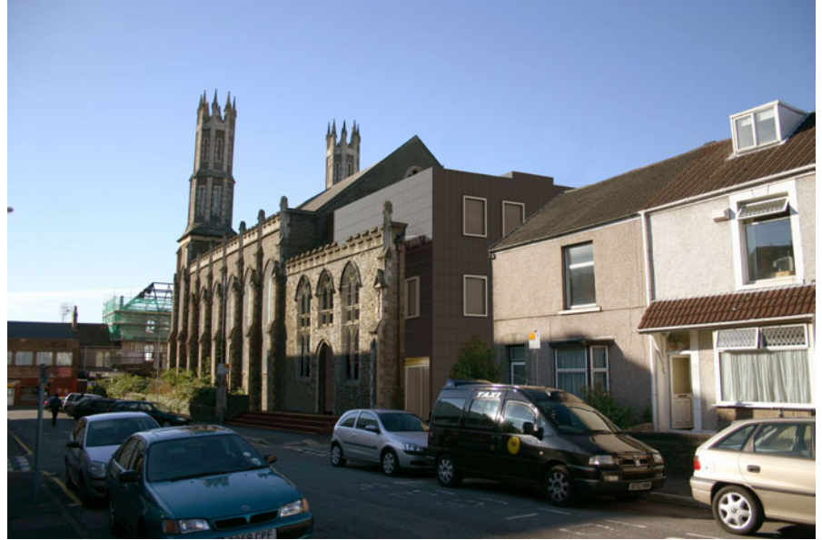
Photomontage of View from George Street

The rear part of the building has been demolished and will be replaced by modern accommodation on 3 floors. The modern extension is screened by the retained East elevation.